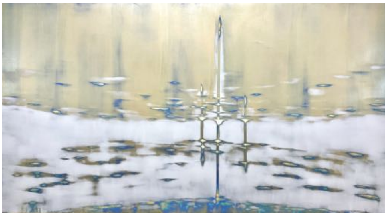
Liquid Trance, 2022

acrylic, plaster paint and metallic pigments on panel