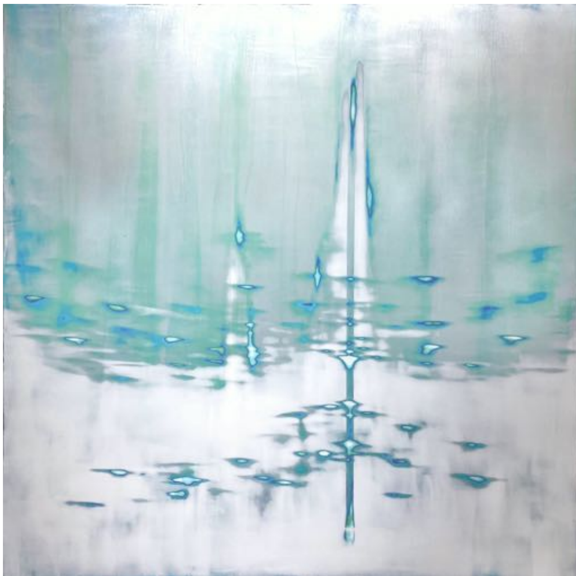
Sea Vision, 2022

acrylic, plaster paint and metallic pigments on panel