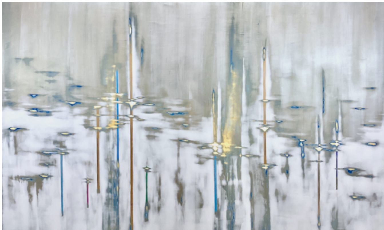
Shimmering Shores, 2022

acrylic, plaster paint and metallic pigments on panel