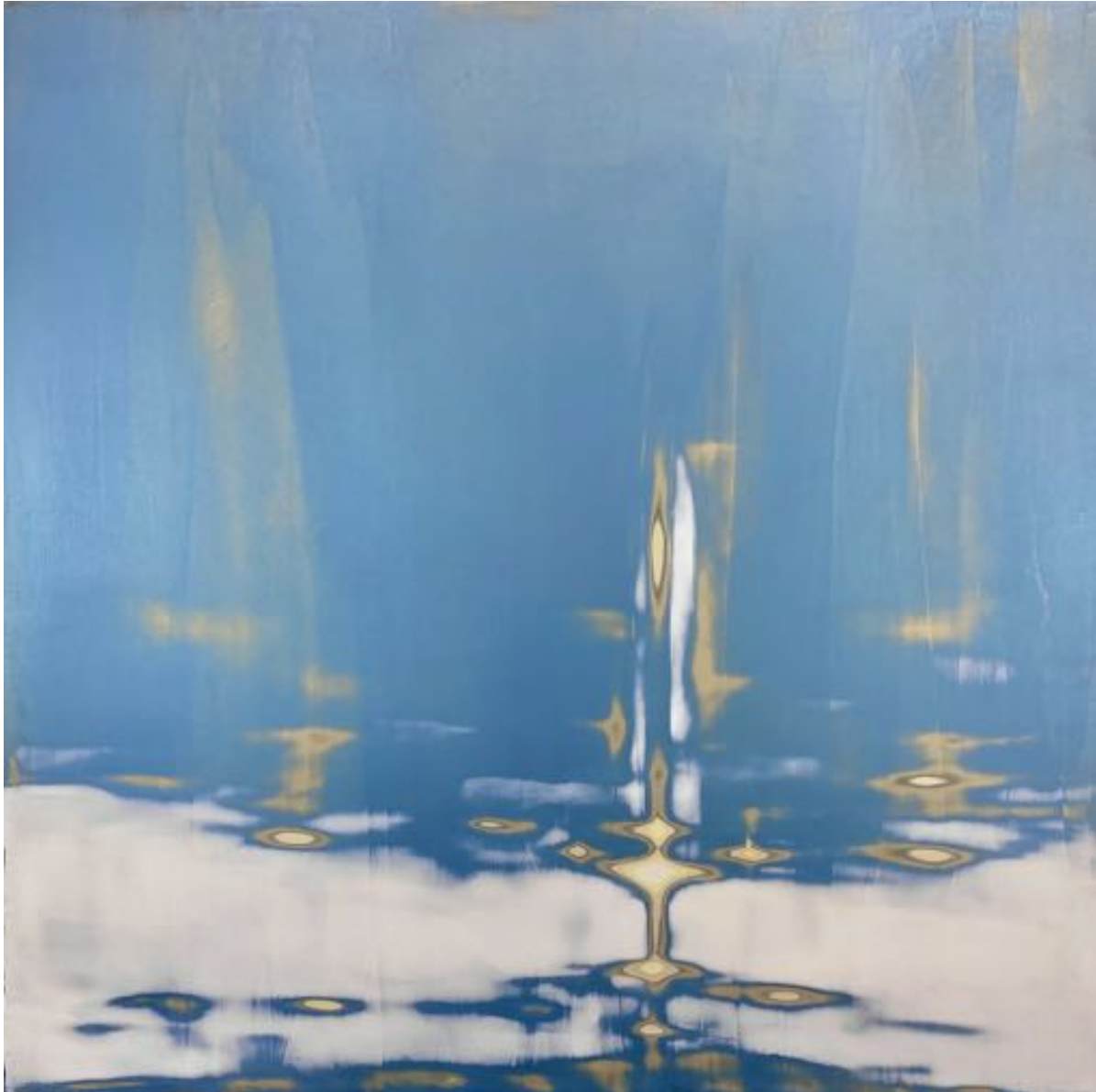
Water's Edge, 2022

acrylic, plaster paint and metallic pigments on panel