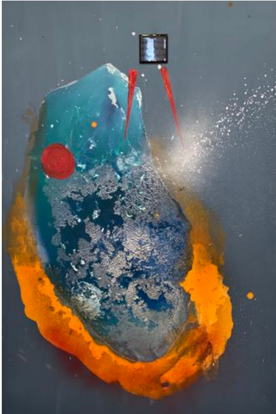
Red Planet II, 2021

Acrylic and Spray Paint and Solar Panel on canvas