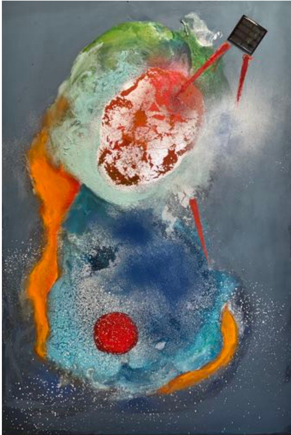
Red Planet III, 2021

Acrylic and Spray Paint and Solar Panel on canvas