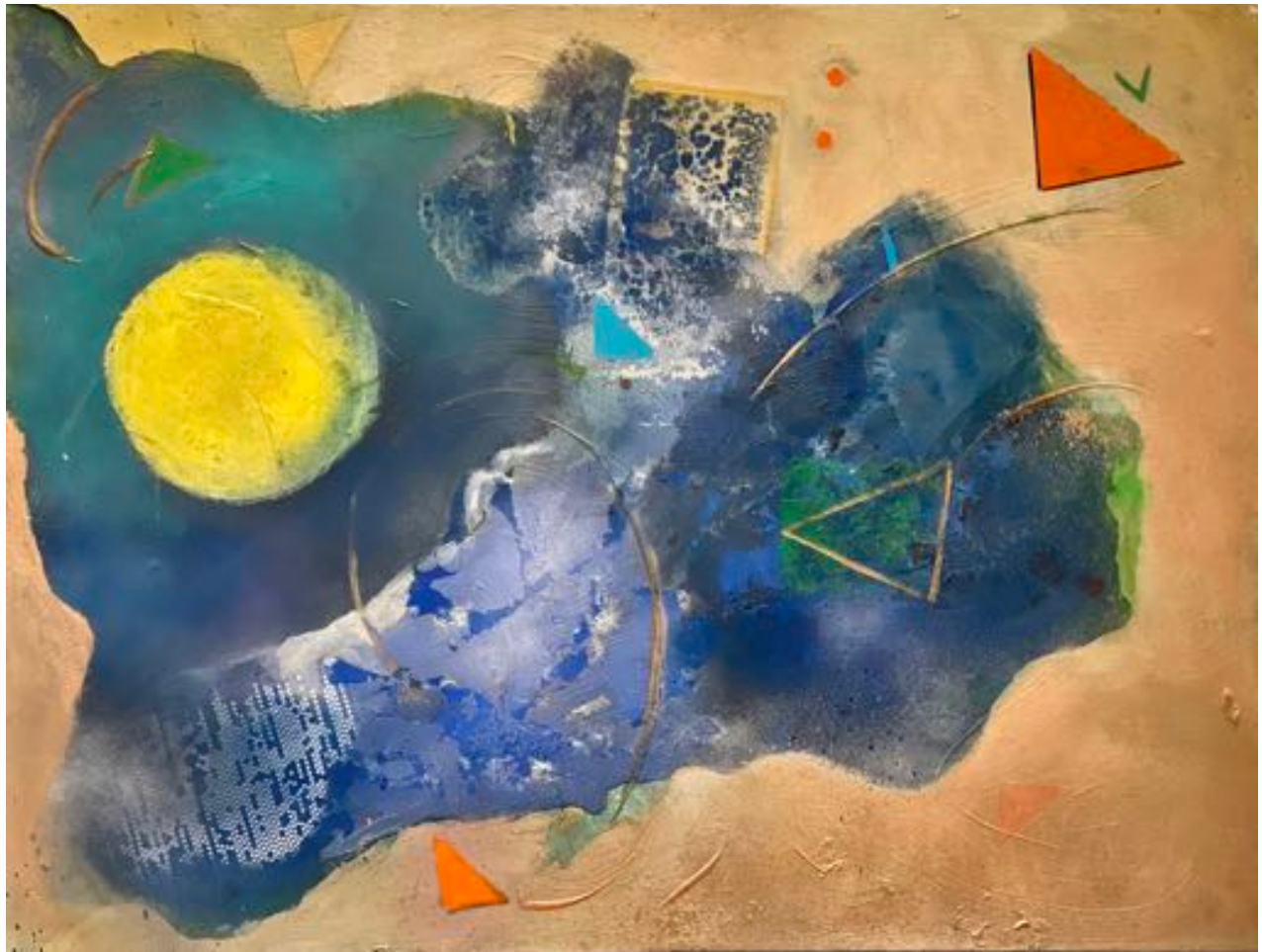
Change in Velocity I, 2019 Acrylic and Spray Paint on canvas 36 x 48 inches