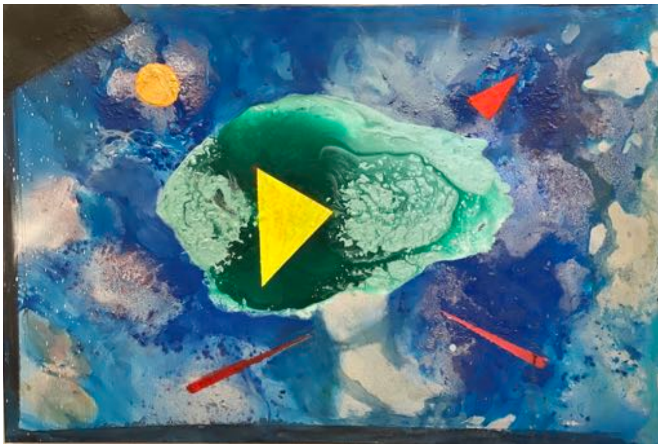
As Time Goes By II, 2021