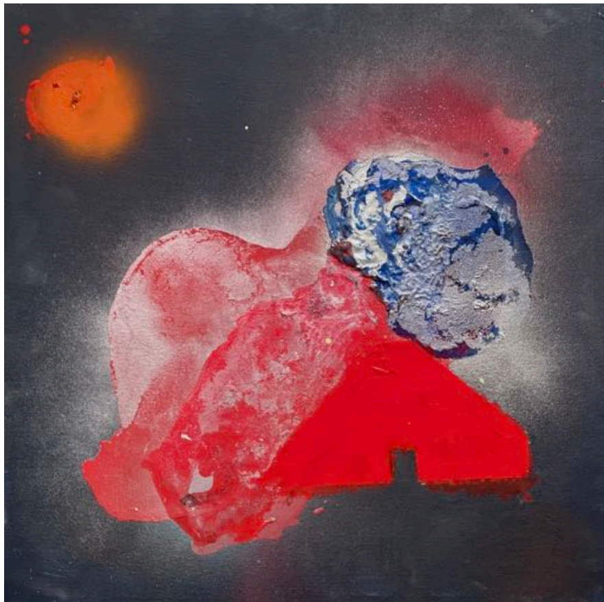
Shelter III, 2021