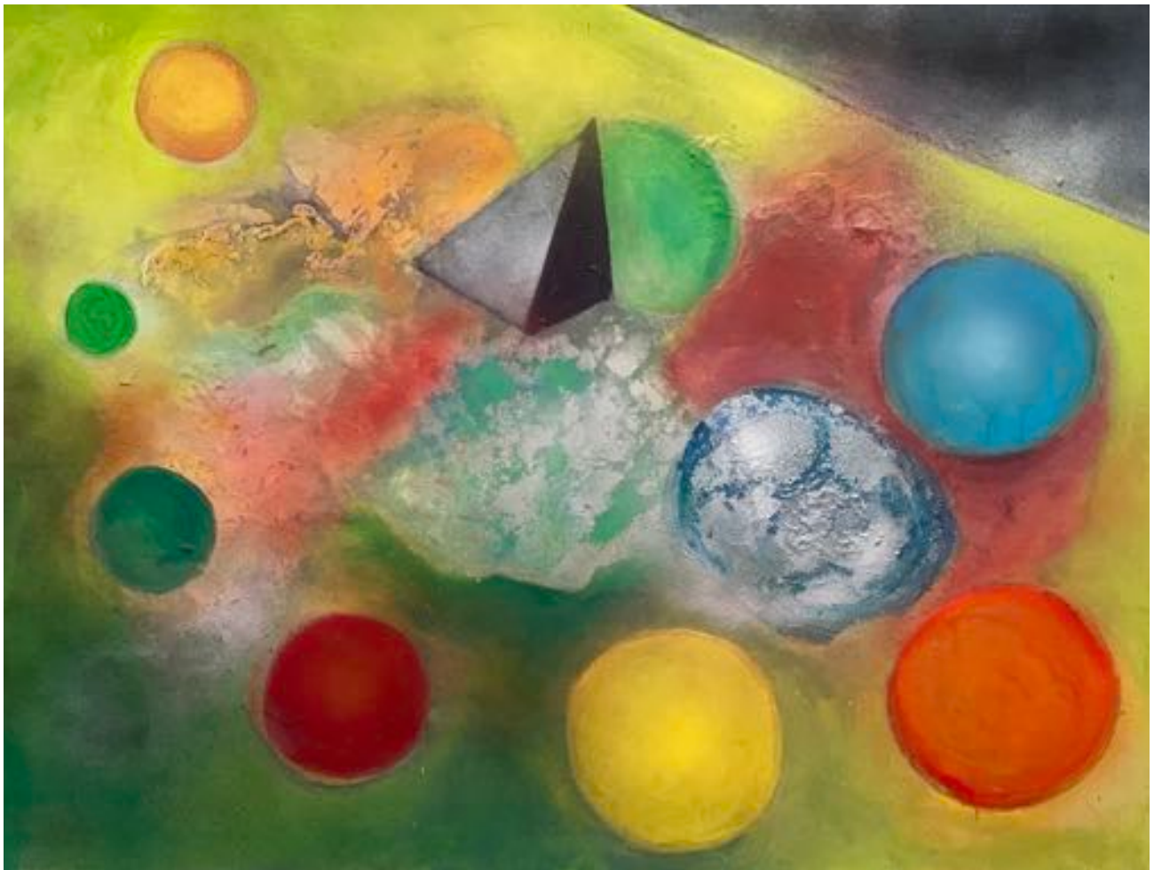
Change in Tempo II, 2021 Acrylic and Spray Paint on Canvas 36 x 48 inches