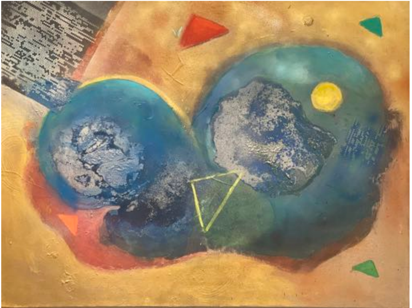
Change in Velocity III, 2019