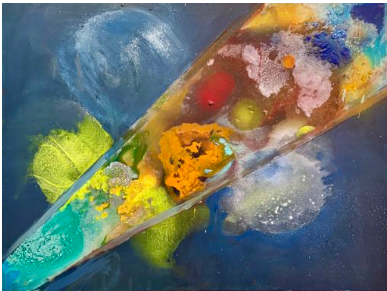
Velocity Contained, 2021