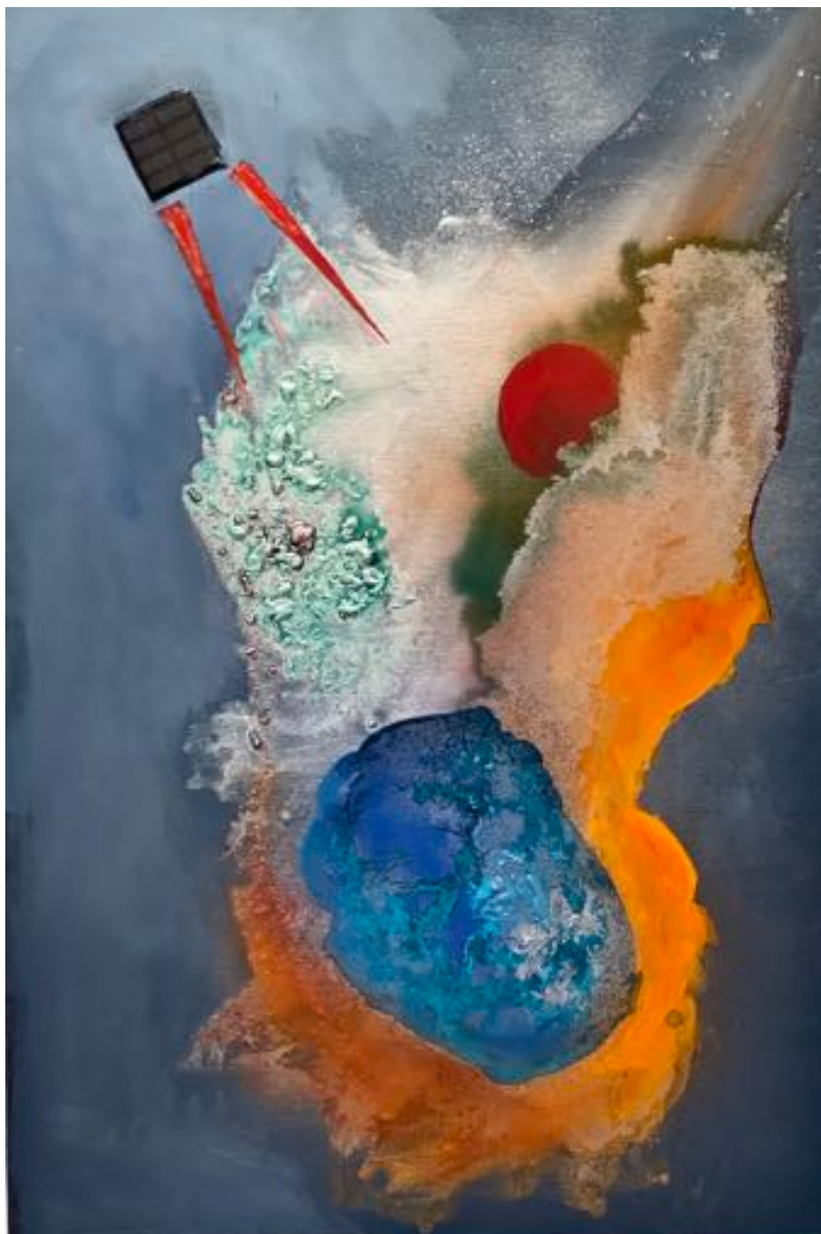
Red Planet I, 2021

Acrylic and Spray Paint and Solar Panel on canvas