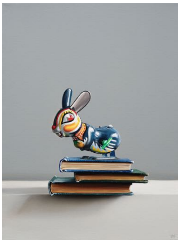
Vintage Wind-Up Bird, 2021, oil on canvas, 16 x 12 inches, Private Collection