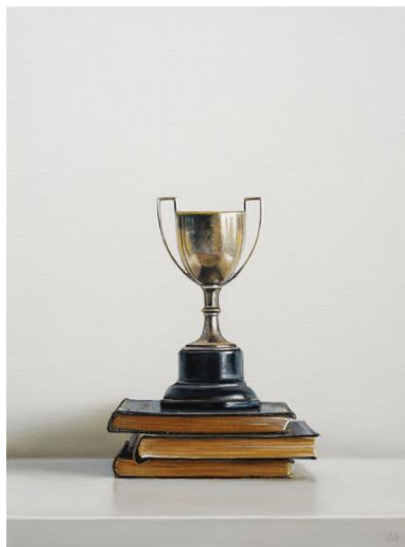
We Have Read This Story Before, 2021, oil on canvas, 16 x 12 inches, Private Collection