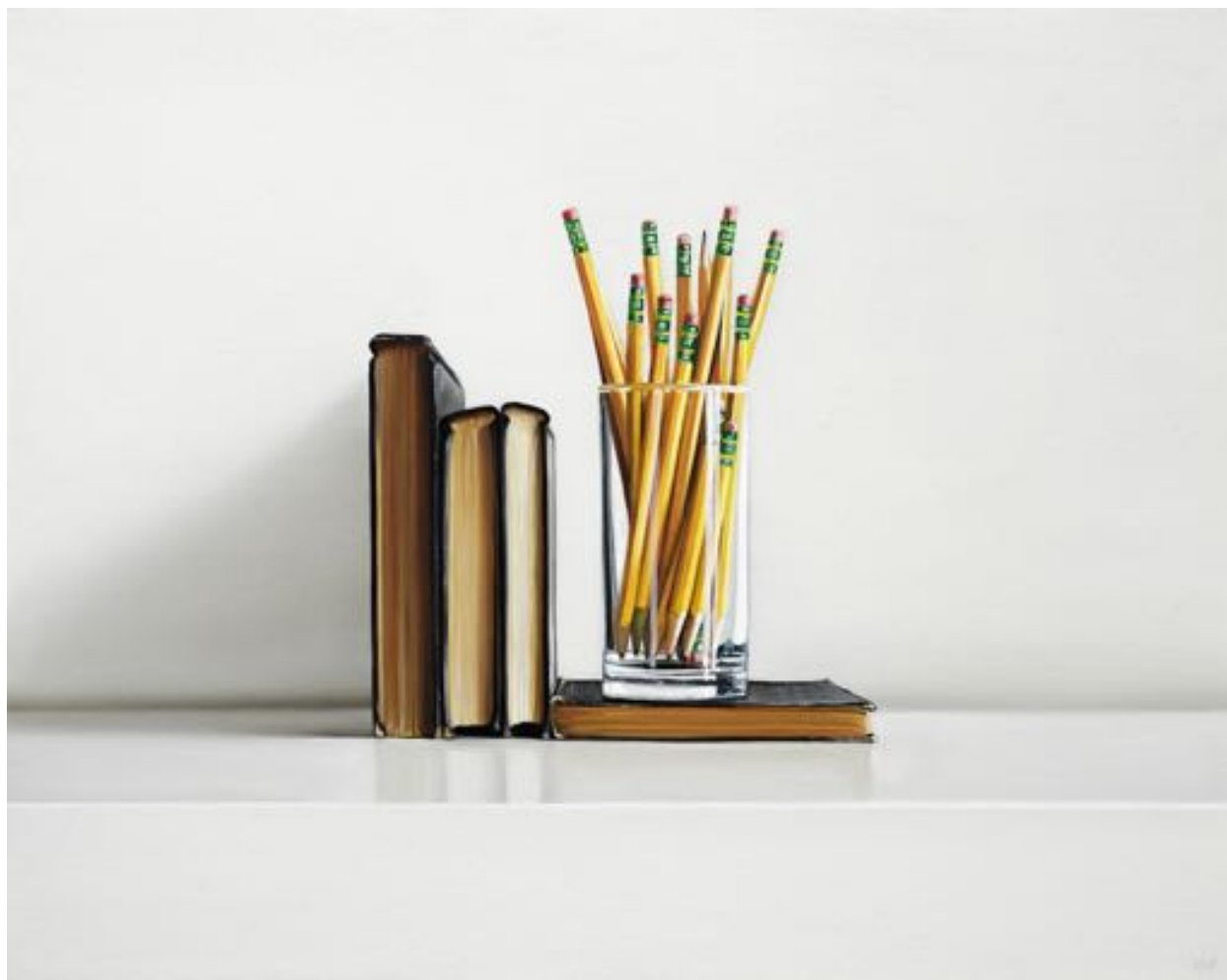
HB Pencils 012022, 2022