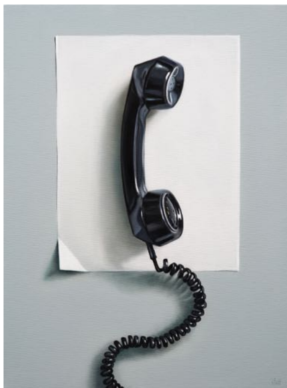
Telephone Receiver I, 2021, oil on canvas, 16 x 12 inches, Private Collection