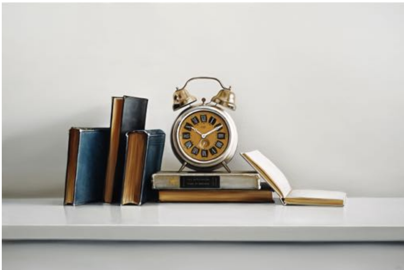
The Interpretation of Dreams 122021, 2021