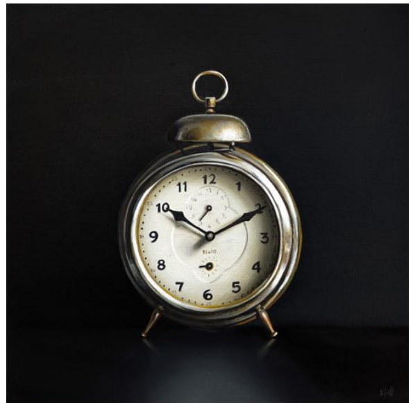
10:10, No.8, 2022, oil on canvas, 10 x 10 inches, Private Collection