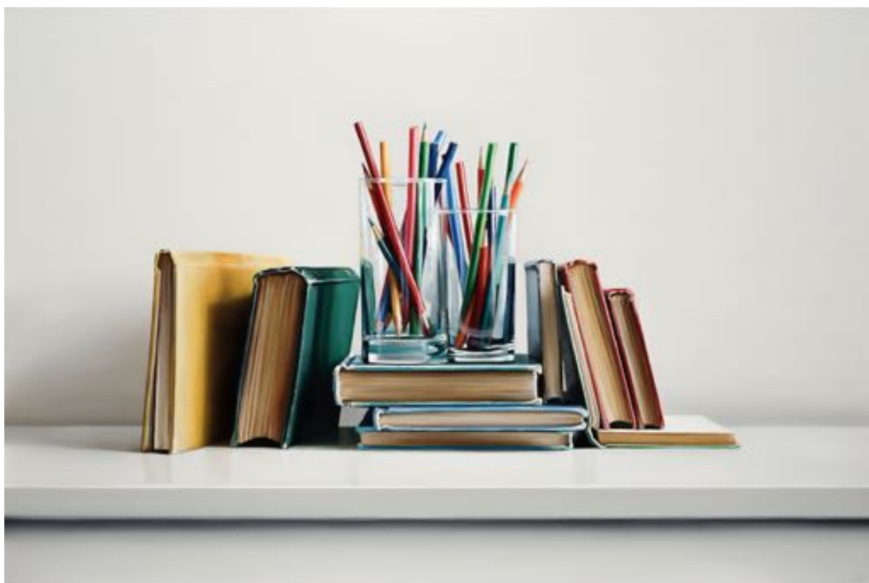
Books & Colored Pencils 122021, 2021