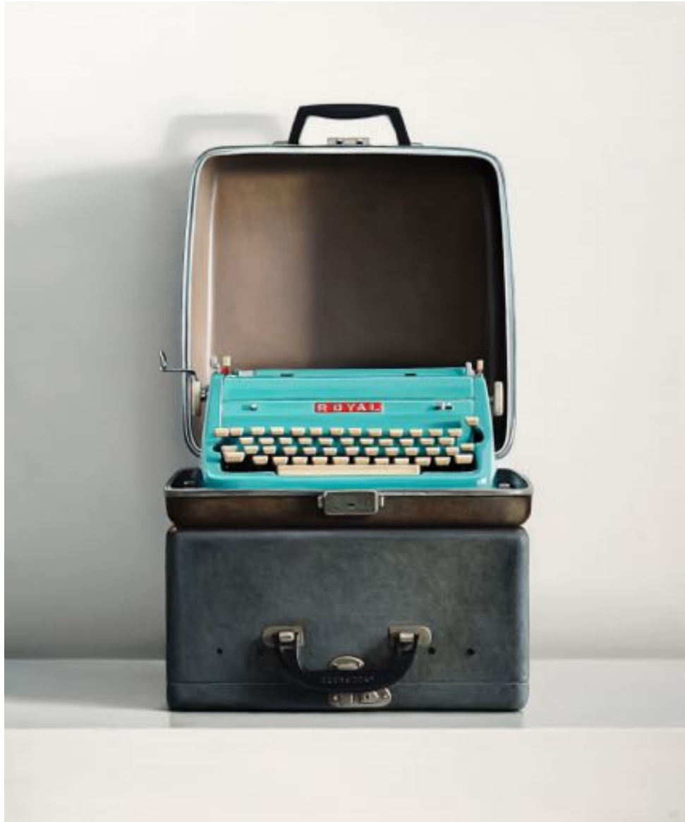
Royal Quiet De Luxe 112021, 2021