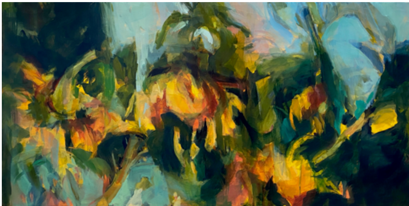
Curling Under, 2020