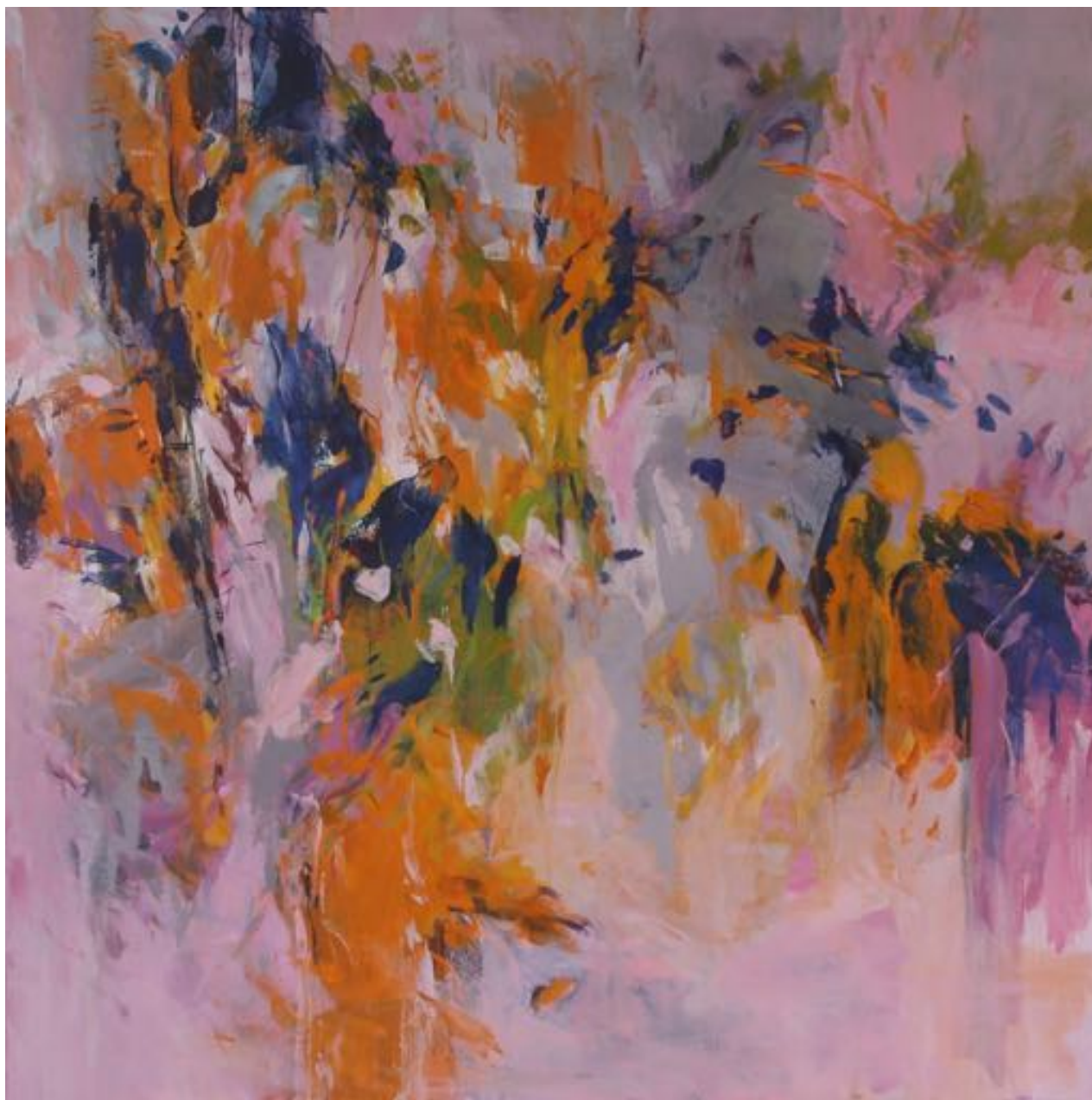
Cobalt Migration, 2019