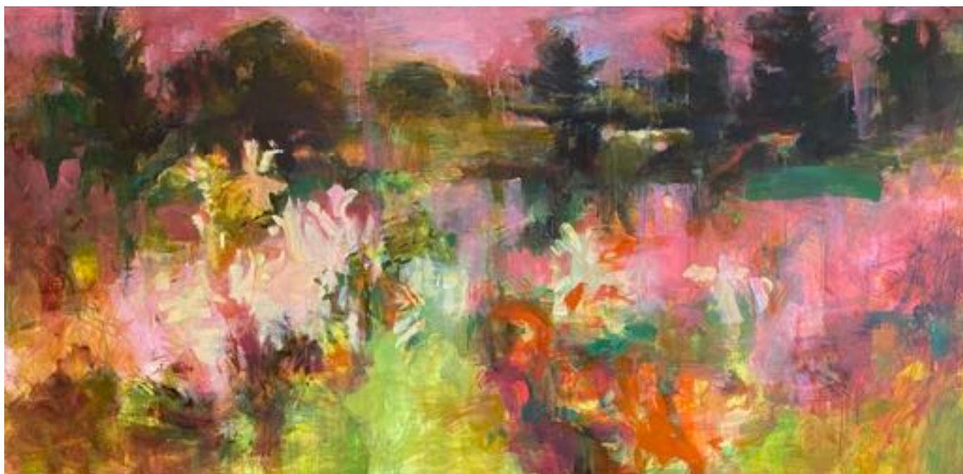
Cathedral Meadow, 2020