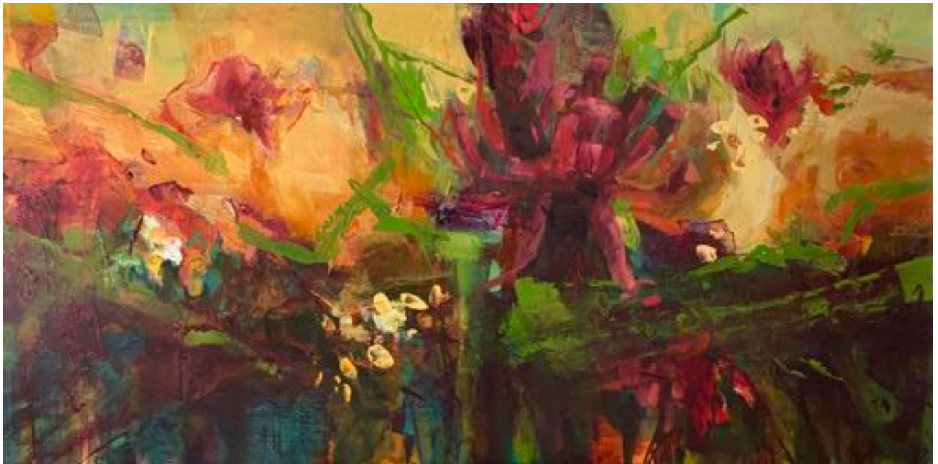
Spice and Bramble, 2021