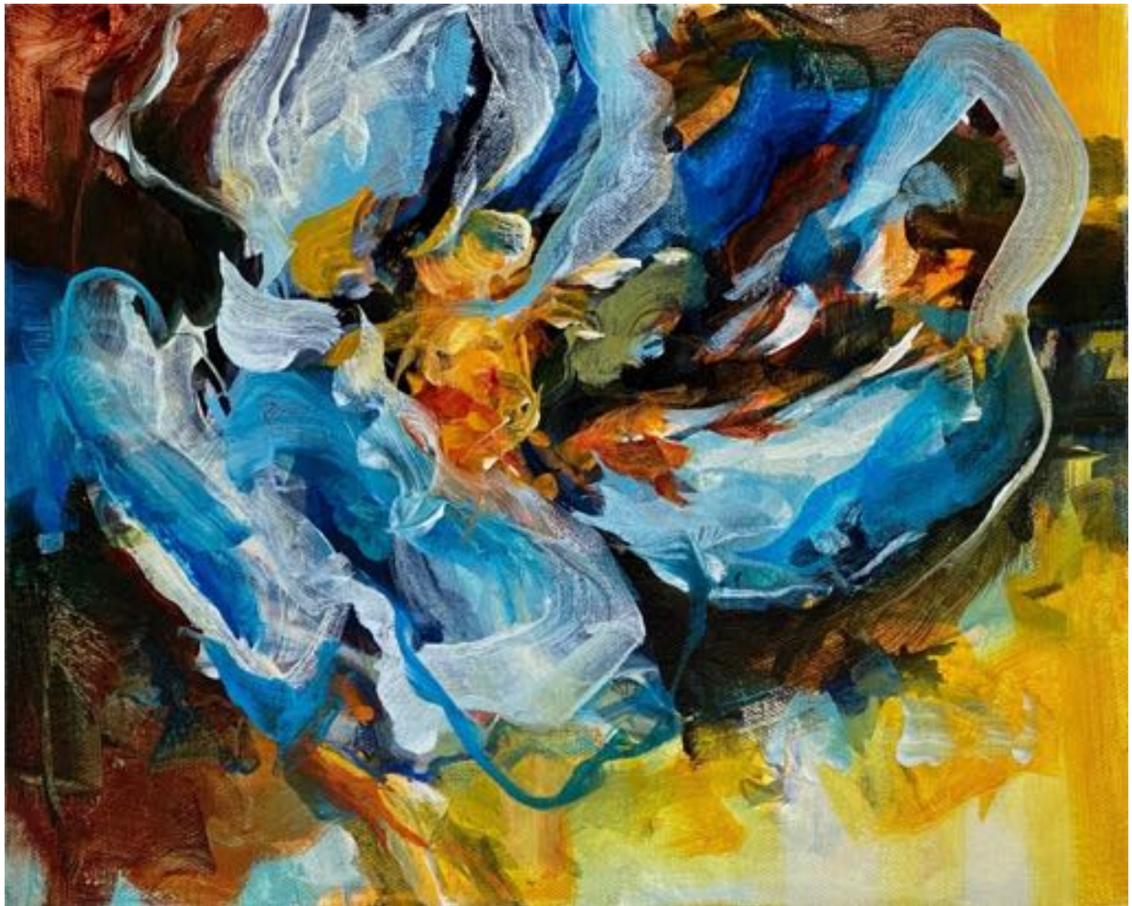
Pretty Wild II, 2020