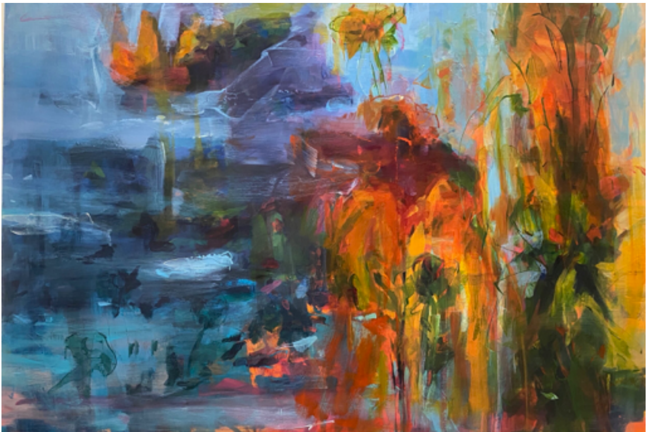
Blue Bosque and Understory I, 2020