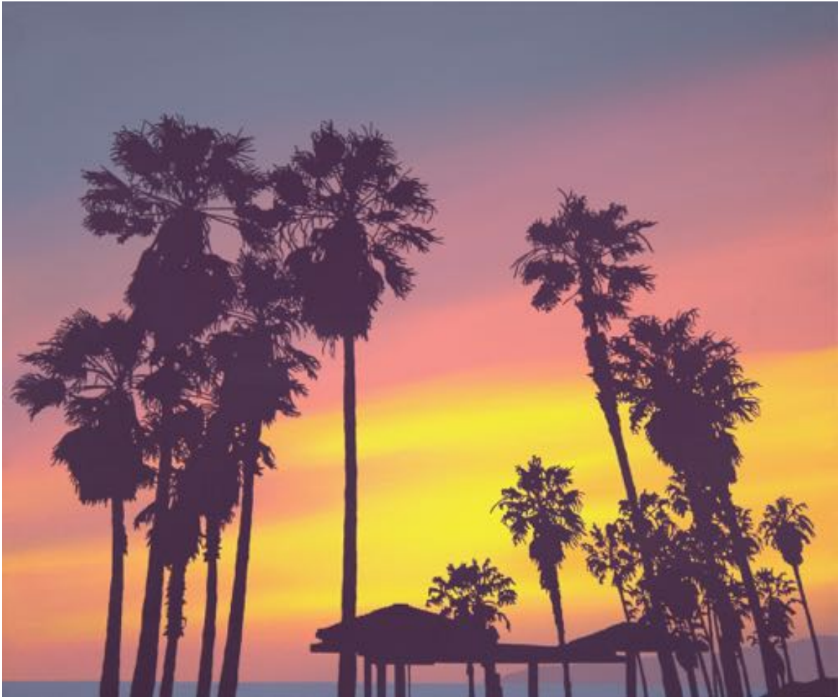
Venice Beach in Crimson, 2021