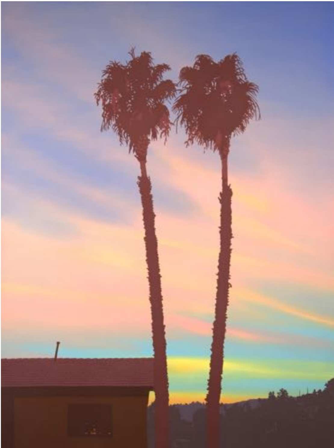
Mt. Washington Loop Palms, 2022