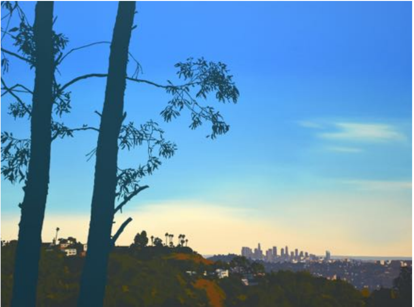
Griffith Downtown View, 2022