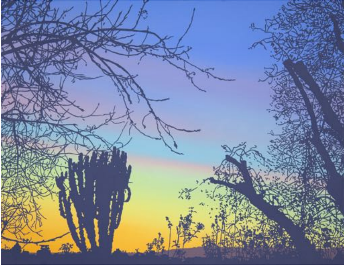
Sea View Cactus in Violet, 2021