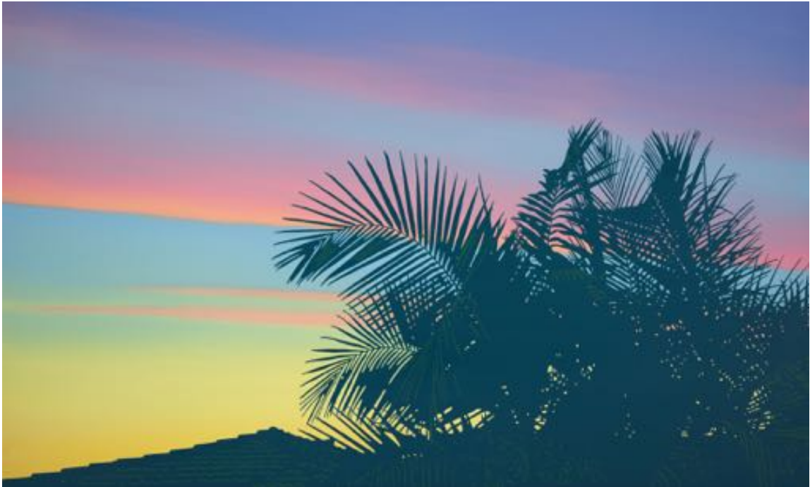
Sea View Rooftop, 2021