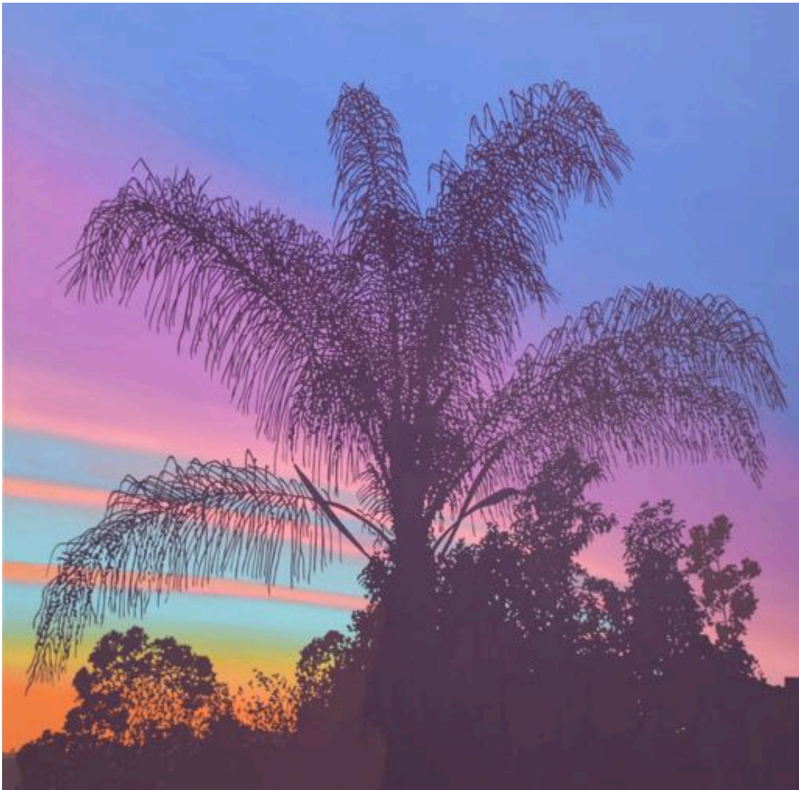
Sea View Champagne Palm in Magenta, 2022