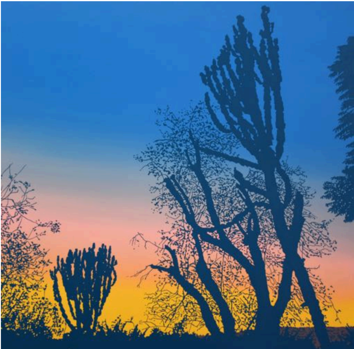
Sea View Cacti in Blue, 2022