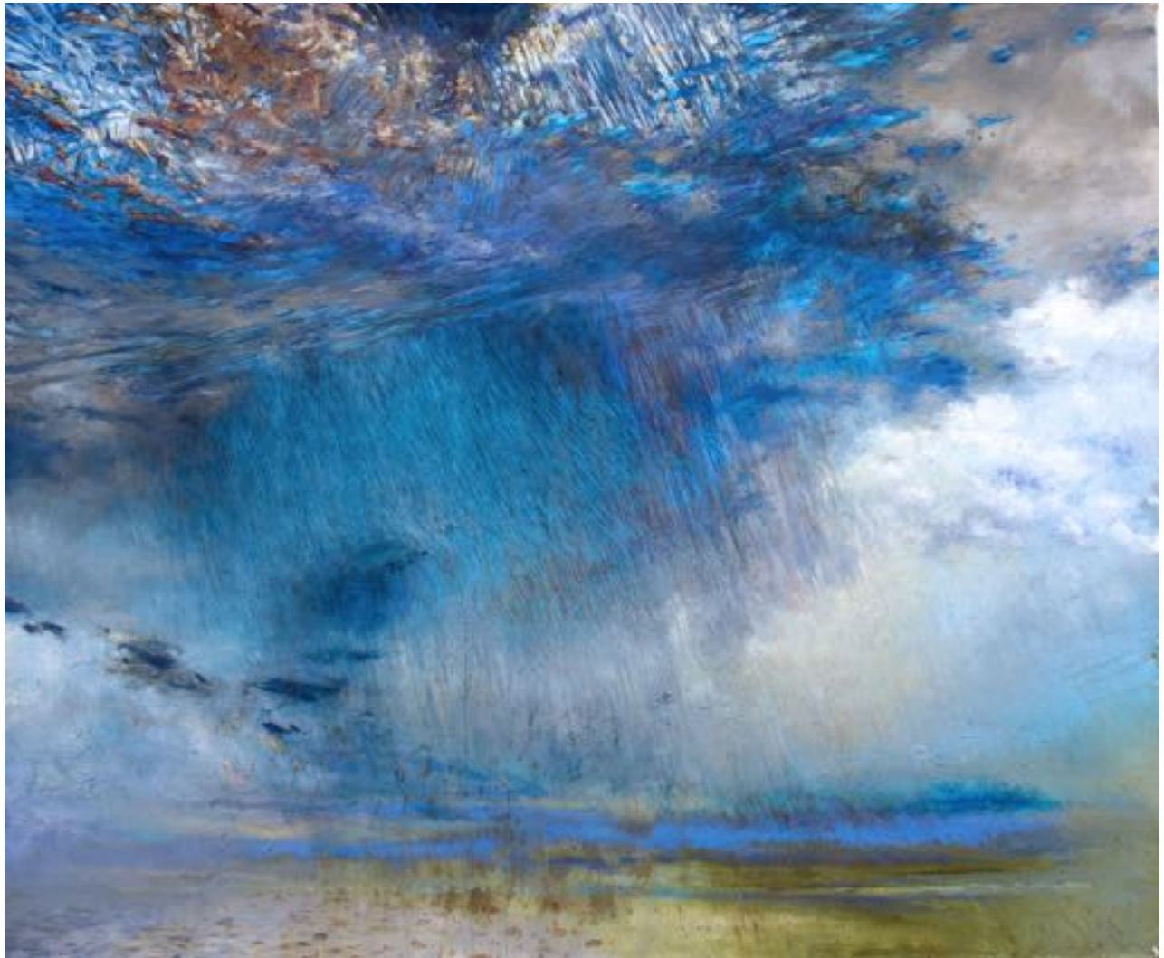
Rain, 2021 acrylic on canvas 58 x 70 inches