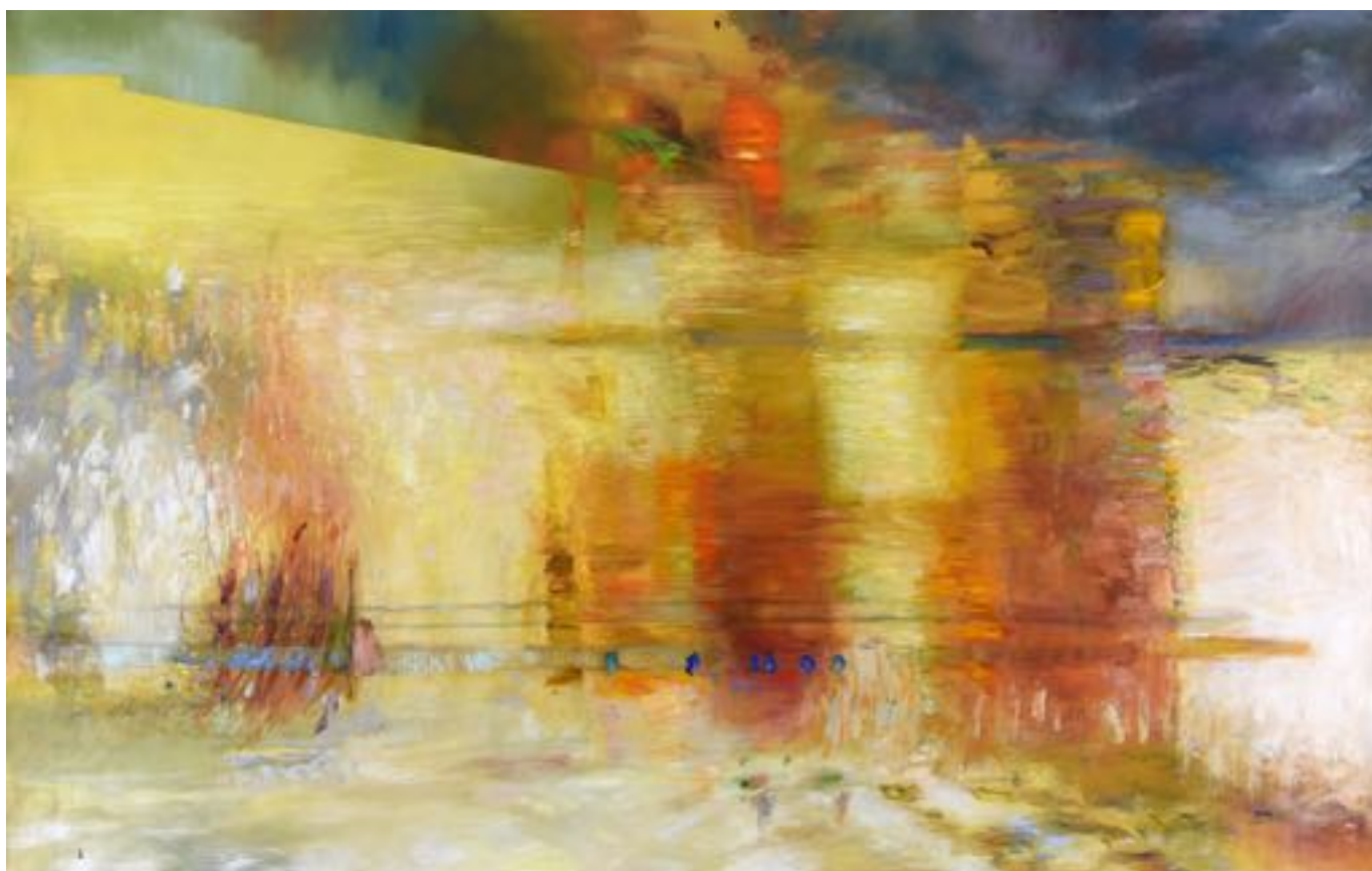
Shimmer, 2022 acrylic on canvas 44 x 70 inches