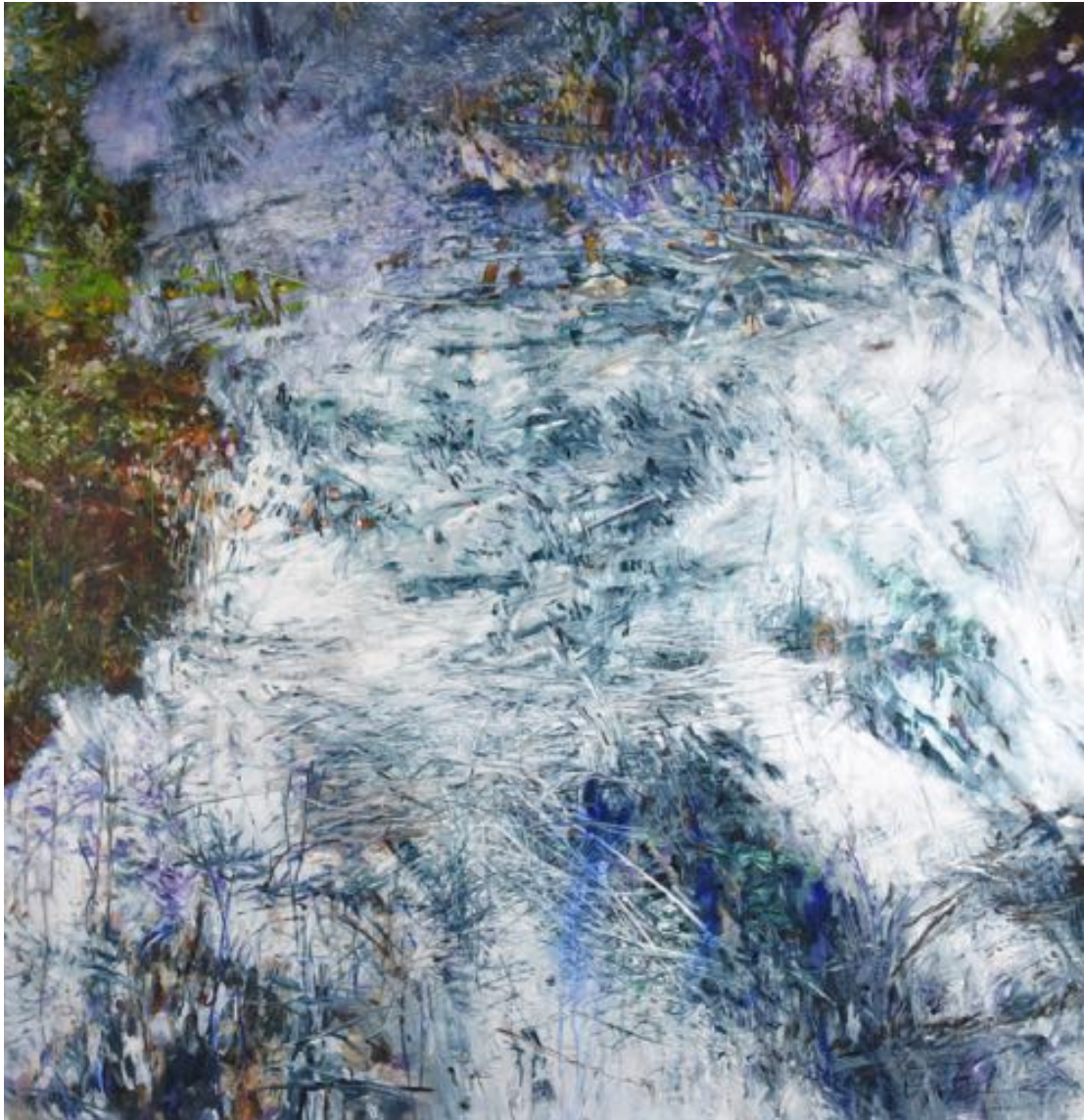
Season Change, 2022