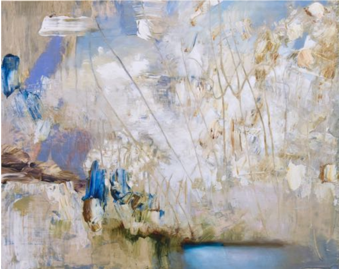
Rock Tracings, 2021