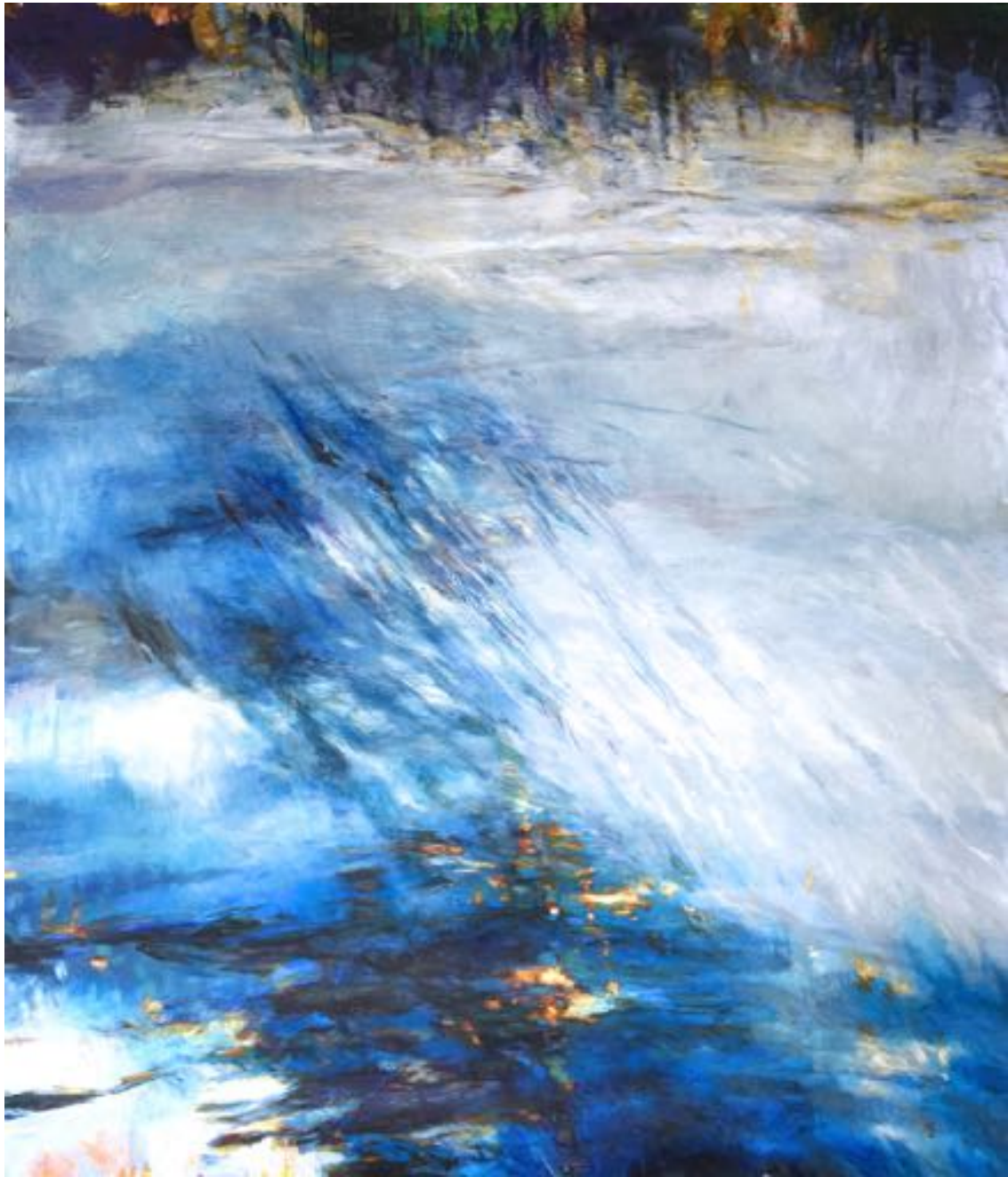
Yosemite Spring, 2021