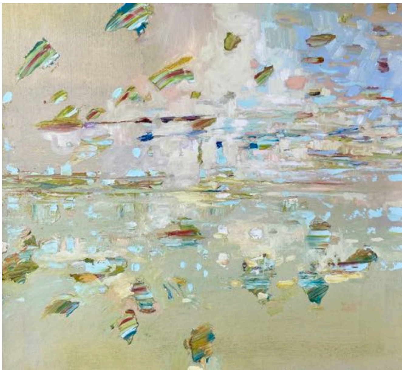
Pastel Horizon, 2022