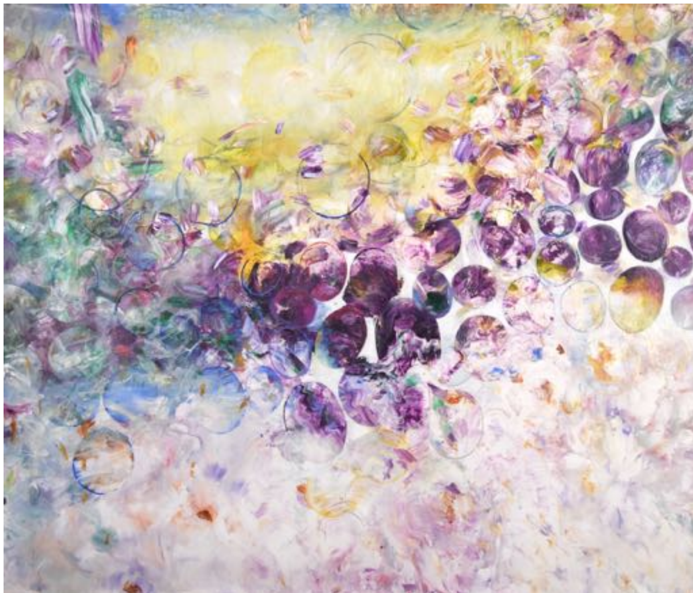
Bubbles, 2022 acrylic on canvas 58 x 66 inches