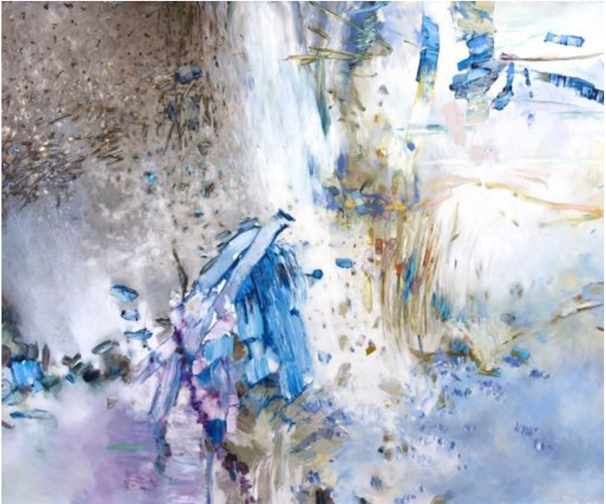
Cascade, 2021 acrylic on canvas 58 x 70inches