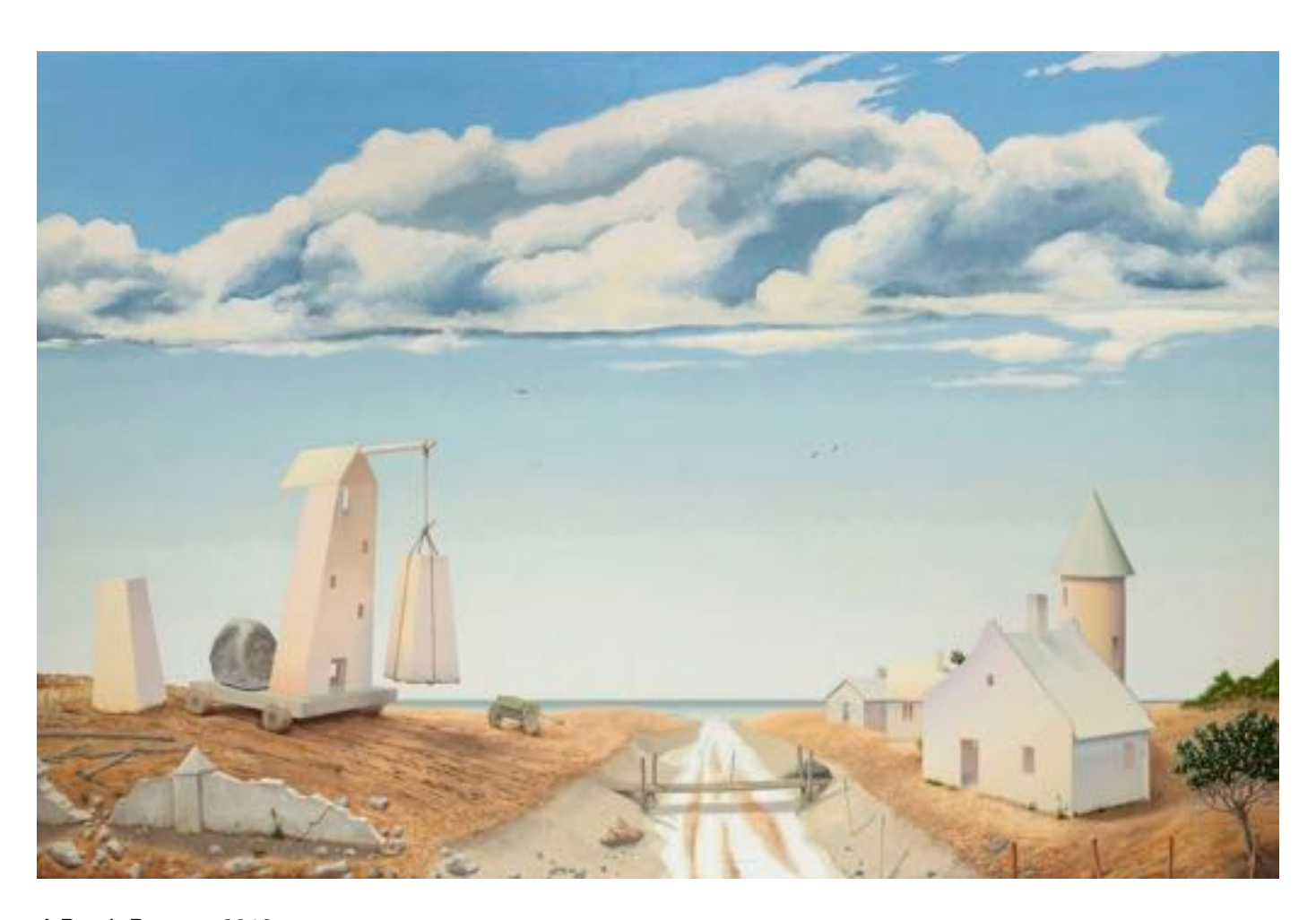
A Dutch Dream, 2019 oil on panel 24 x 36 inches