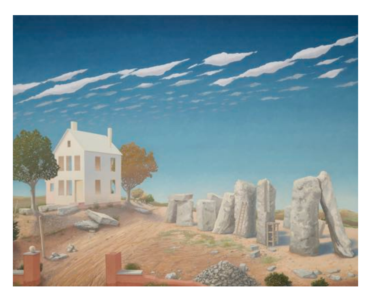
Backyard Monoliths, 2021 oil on panel 22 x 28 inches