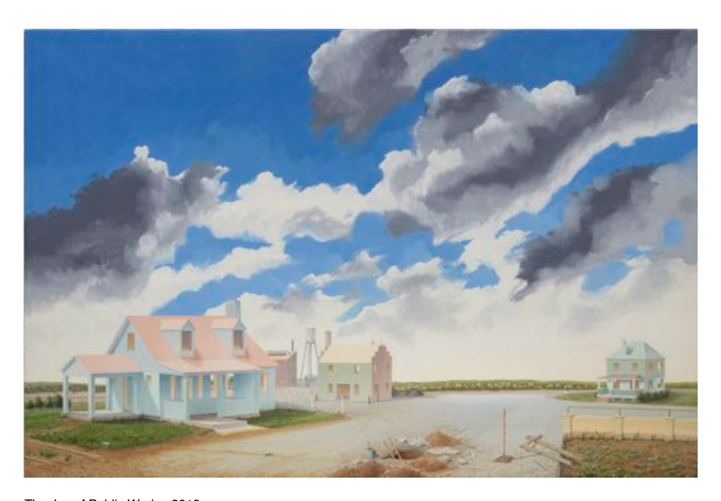
The Joy of Public Works, 2019 oil on panel 24 x 36 inches