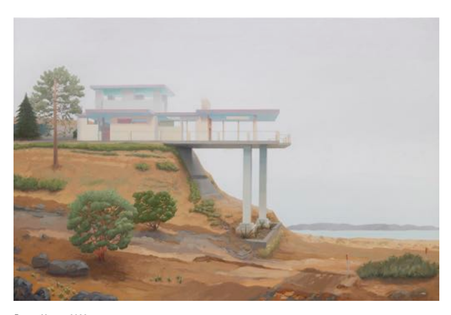
Dream House, 2022 oil on panel 24 x 36 inches