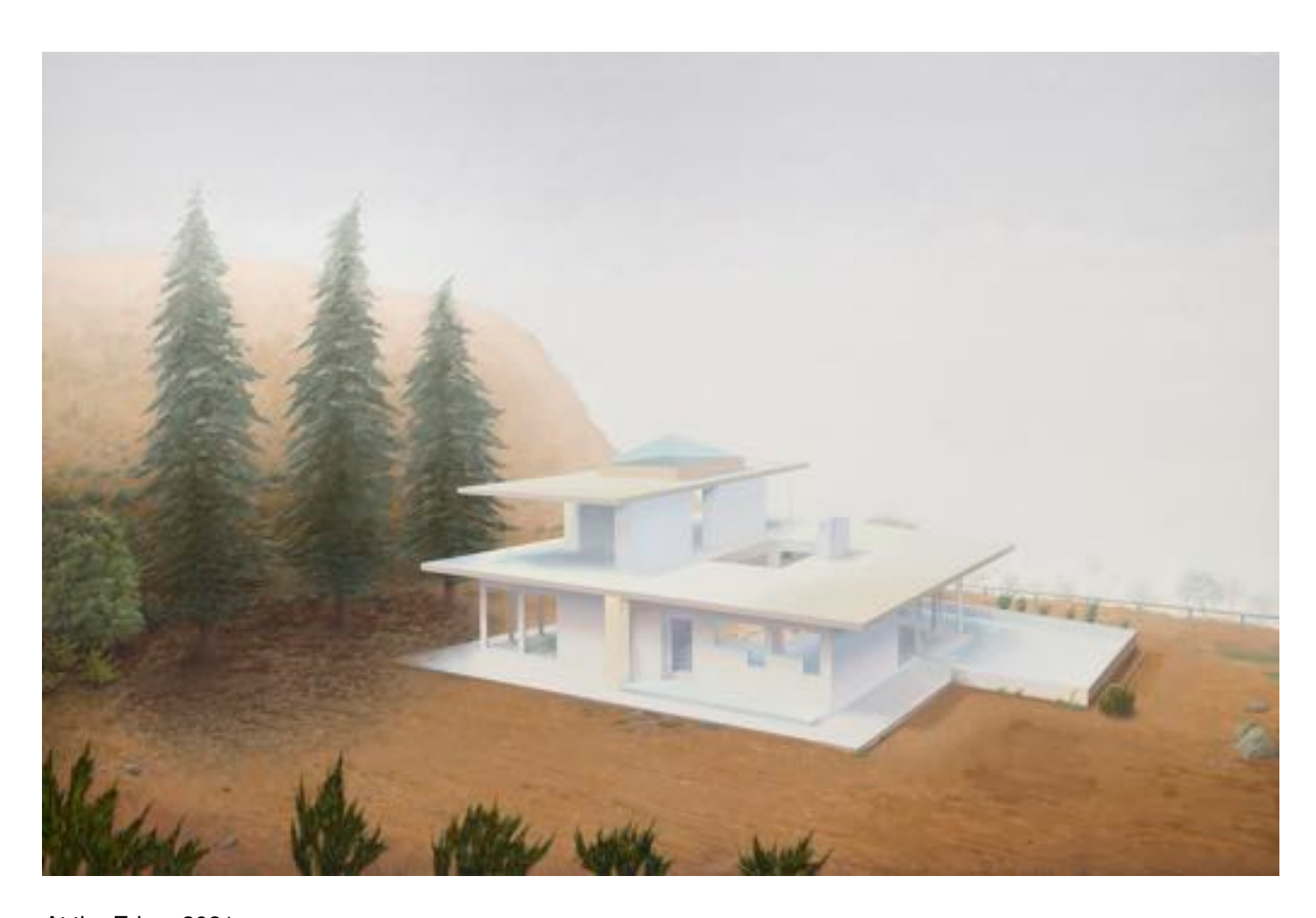
At the Edge, 2021 oil on panel 24 x 36 inches