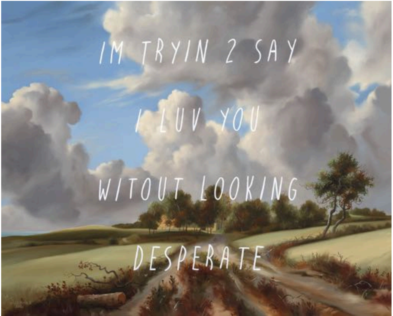
Wheat Fields: I'm Trying To Say I Love You Without Looking Desperate, 2021