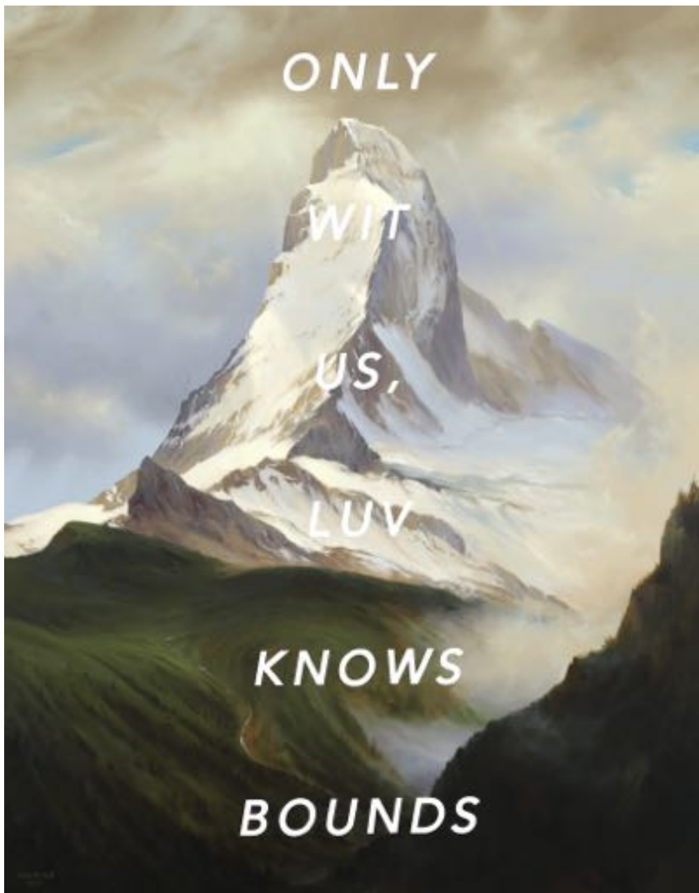
Matterhorn: Only With Us, Love Knows Bounds, 2020