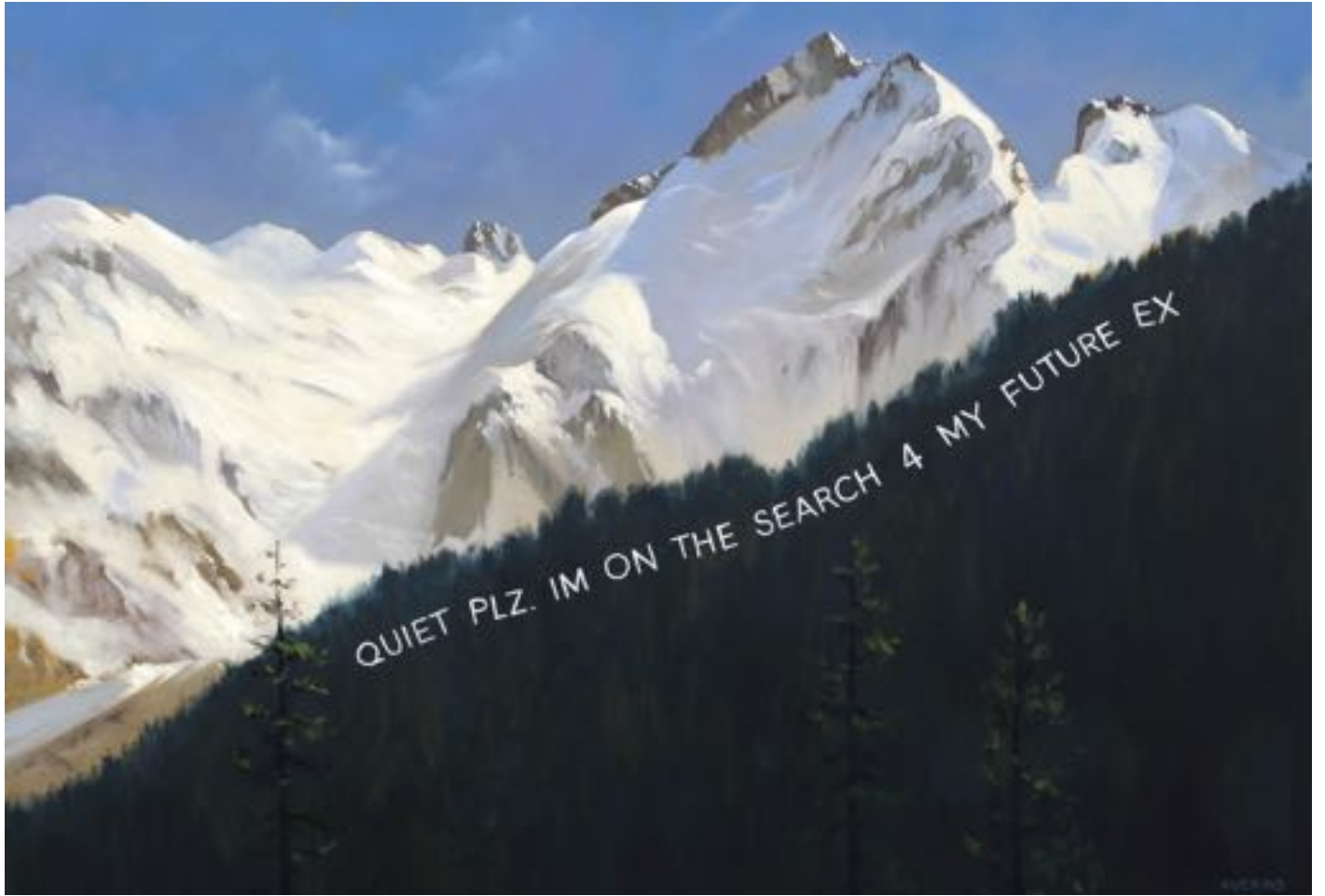
Piz Bernina: Quiet Please. I'm On The Search For My Future Ex, 2021