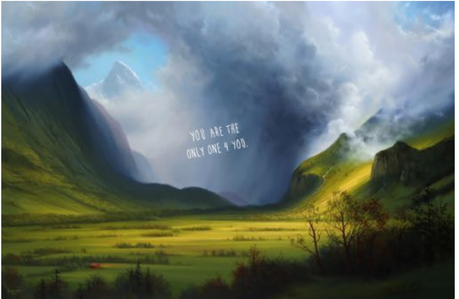
Storm In The Mountains: You Are The Only One For You, 2021