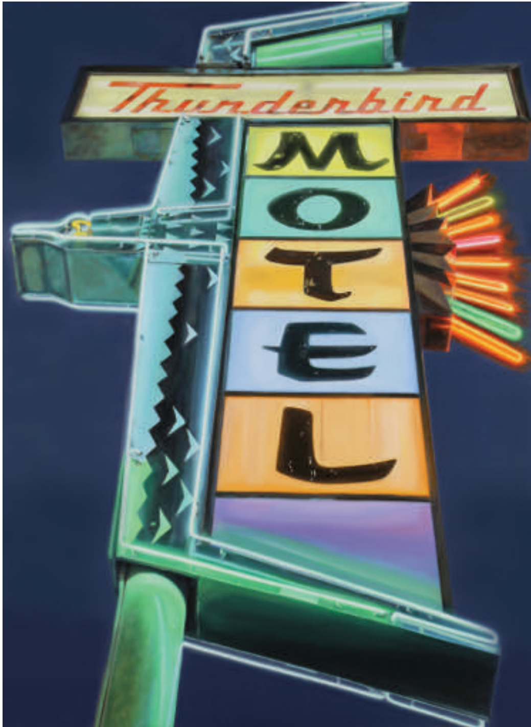
T-Bird Motel, 2020