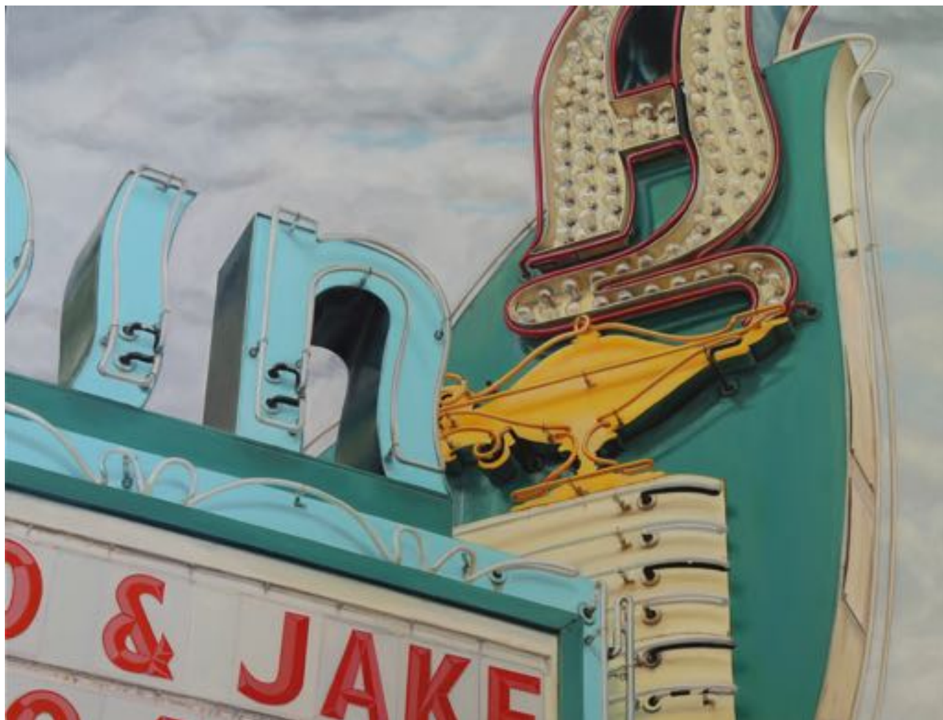
Aladdin, 2018 oil on canvas 33 x 44 inches