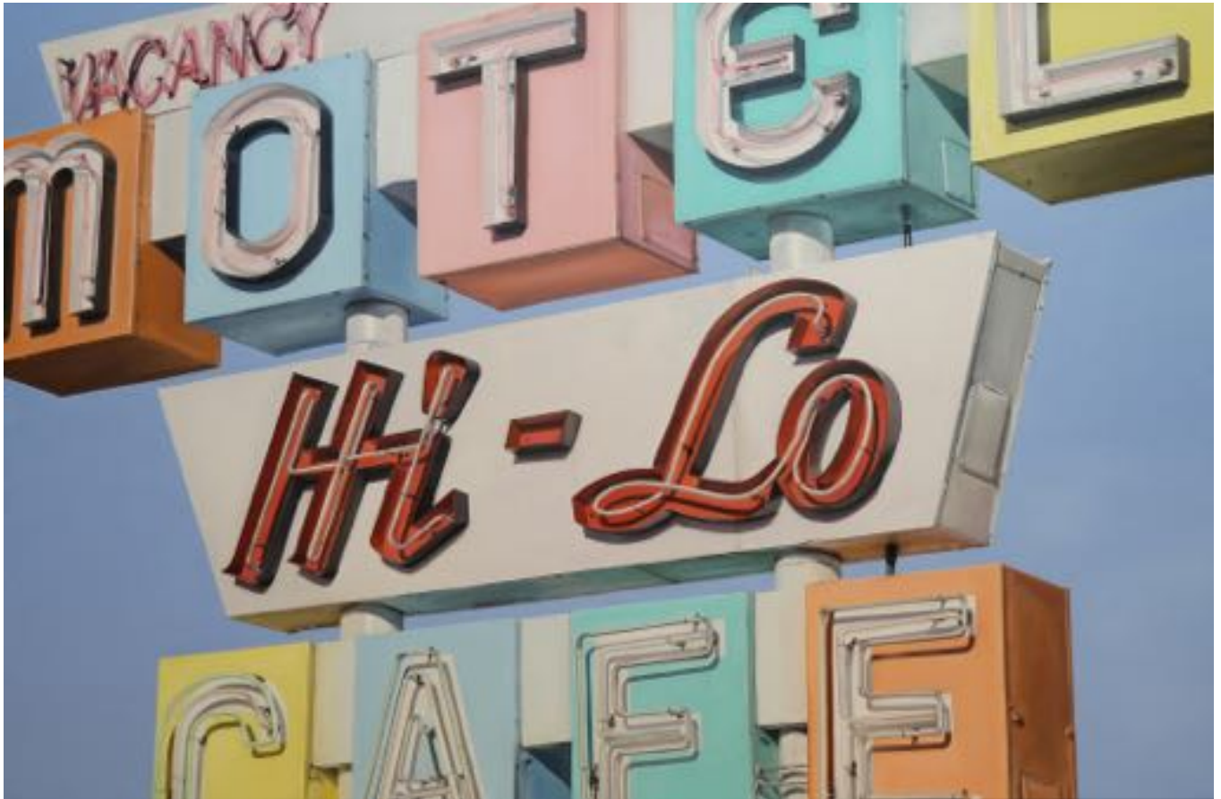
Hi-Lo Motel (Vacancy XI), 2021