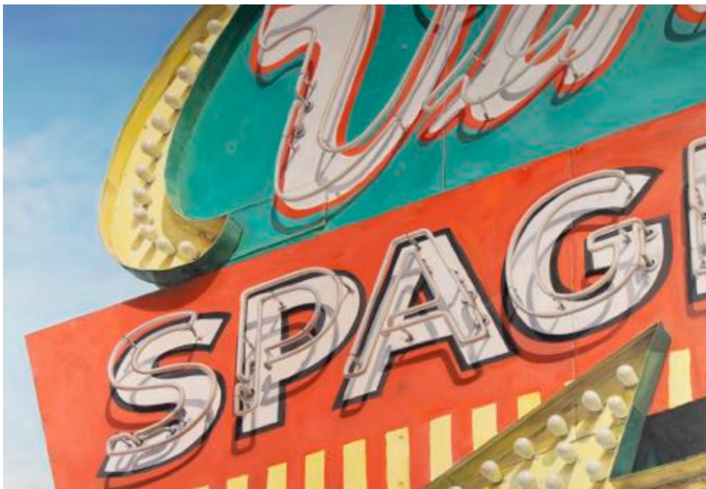
Vince's Spaghetti, 2018