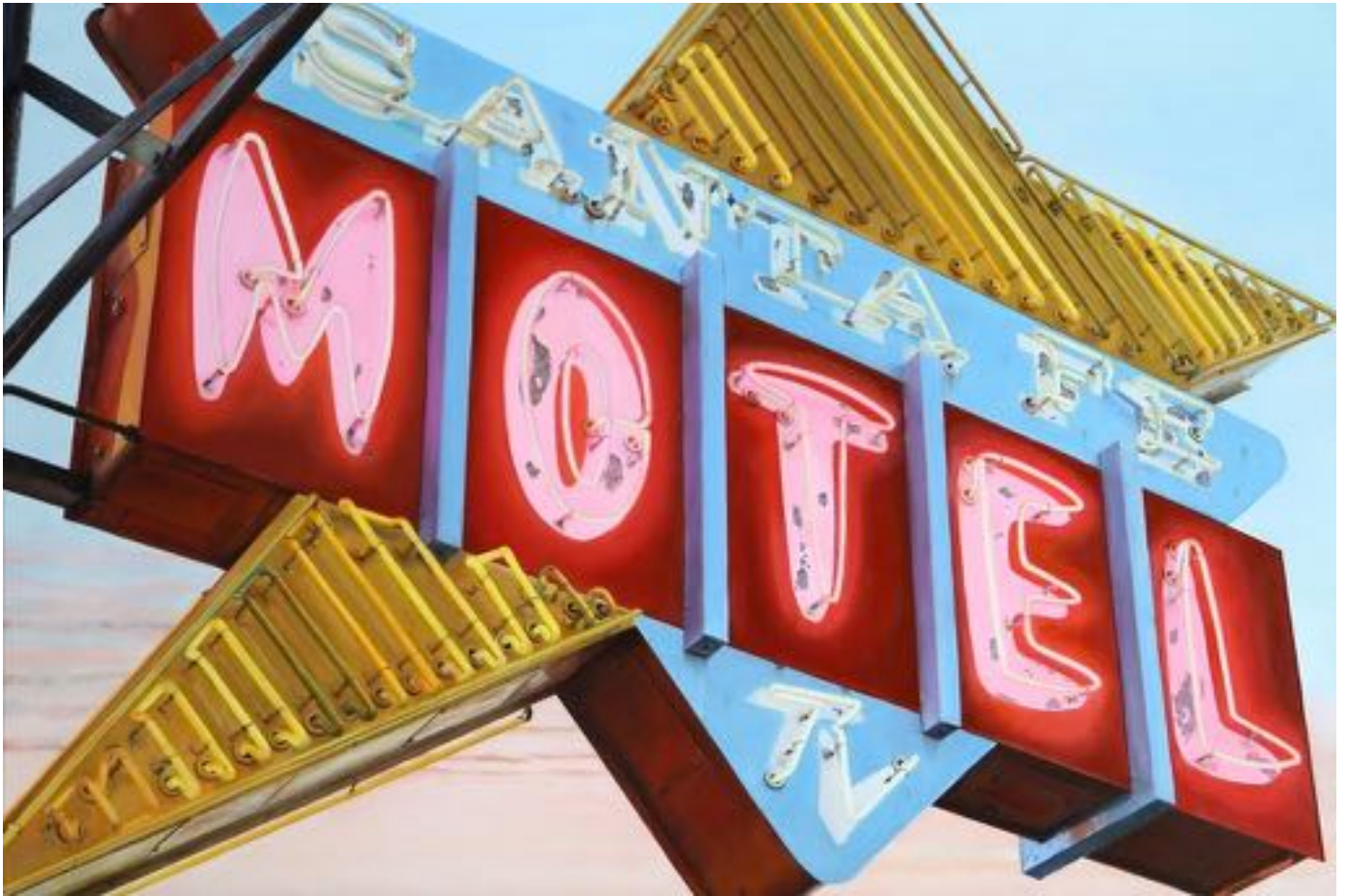
Santa Fe Motel, 2018