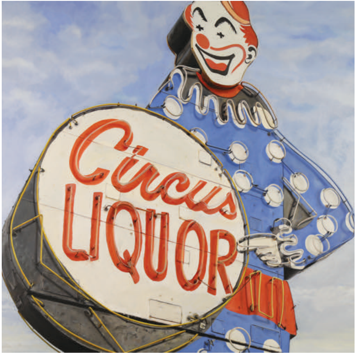
Circus Liquor, 2021